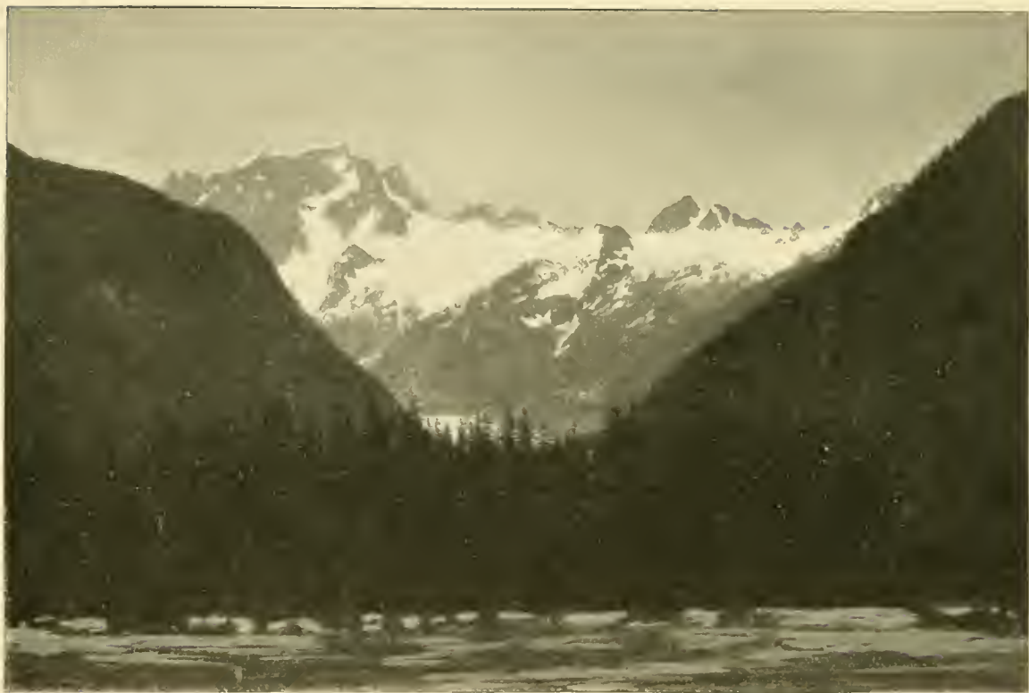
Sawback Range on Stickeen.